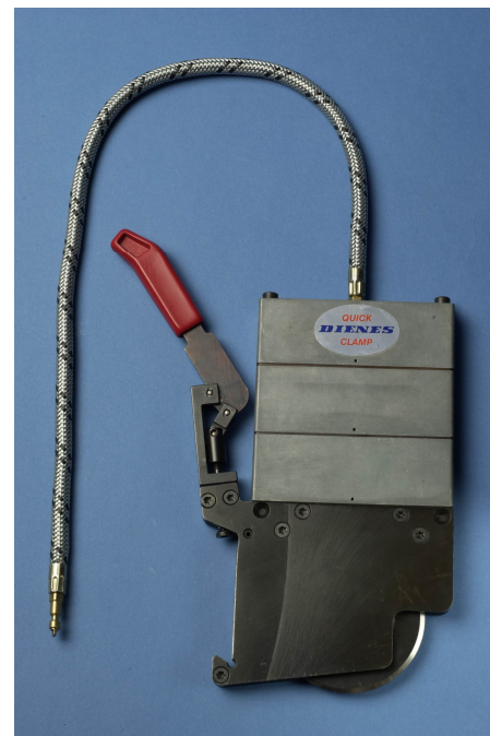
DIENES Messerhalter PQD-MC-3