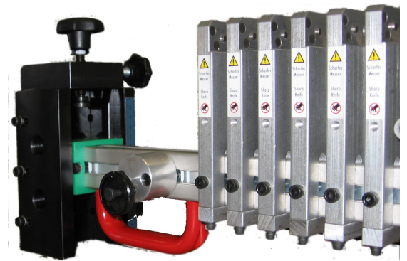
picture of a similar system that has already been delivered

Advantages: - reasonable price - easy adjustment - set-up time reduction - narrower slit widths